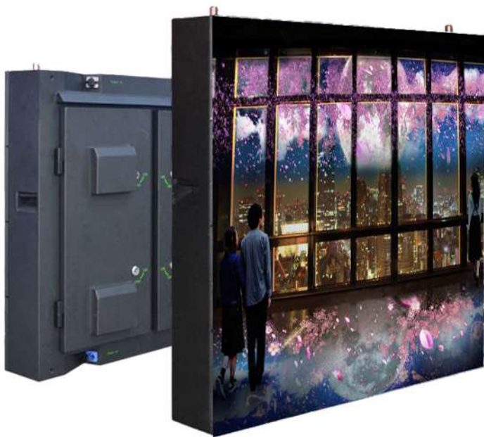
Cabinet drawing (size base on requirement)