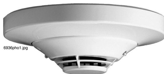
FST-851 Series in B710LP base