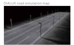
DIALUX road simulation map