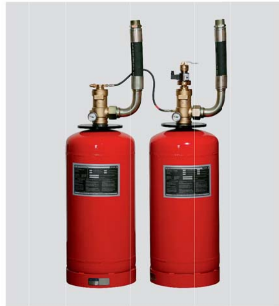
Example of a multi-cylinder system