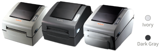
SLP-D420 (Standard Type) SLP-D420D (Peeler Type) SLP-D420C (Auto-cutter Type)

4 inch Direct Thermal Desktop Label Printer