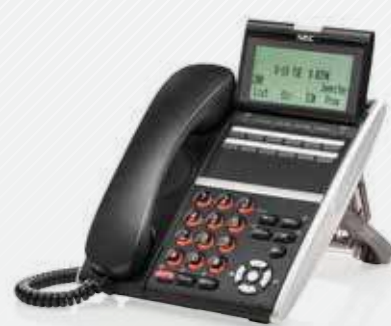
DT430 & DT830