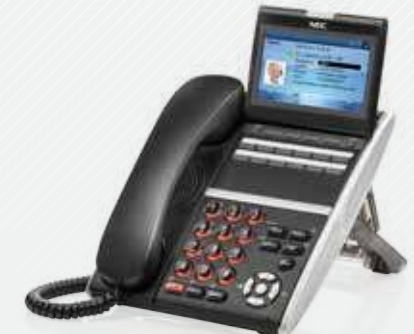
DT830CG Color Display