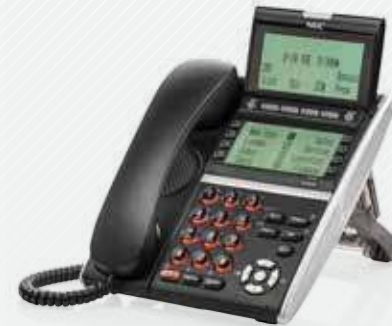
DT430 & DT830 Dual Display (Desi-less)