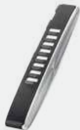
8-line Key Module