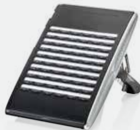
60-line DSS Console