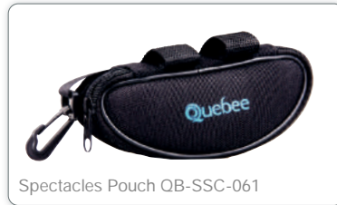
Spectacles Pouch QB-SSC-061