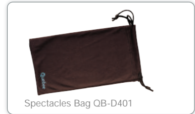
Spectacles Bag QB-D401