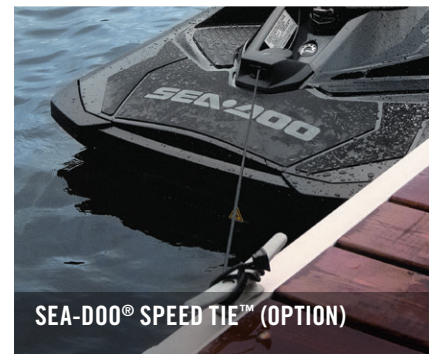
SEA-DOO® SPEED TIE™ (OPTION)