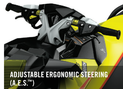
ADJUSTABLE ERGONOMIC STEERING (A.E.S.™)