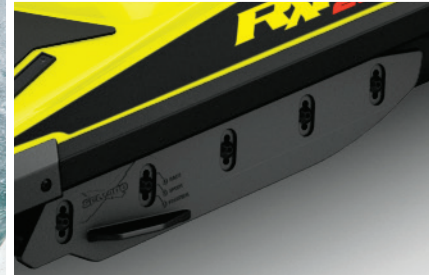
ADJUSTABLE REAR SPONSONS