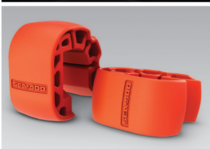
SNAP-IN FENDERS (OPTION)