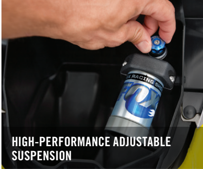
HIGH-PERFORMANCE ADJUSTABLE SUSPENSION