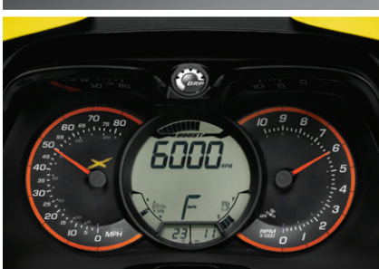
X-GAUGE WITH BOOST INDICATOR