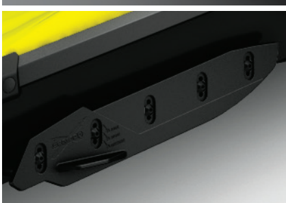
ADJUSTABLE REAR SPOILERS