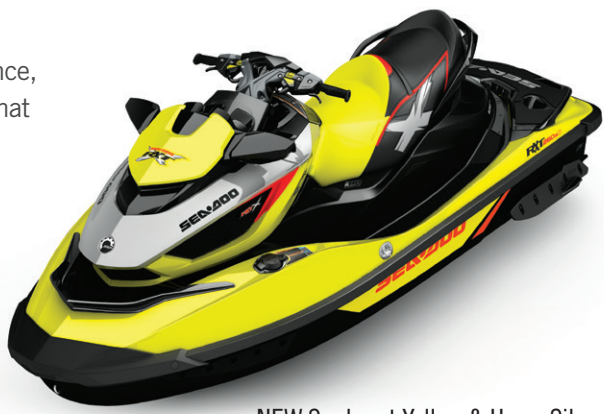
NEW Sunburst Yellow & Hyper Silver

Get the ultimate in offshore performance, with this high-horsepower watercraft that redefines speed and handling. Added performance features include a fully adjustable suspension that allows you to customize your aggressive ride and trim tabs that fine-tune the attitude of the watercraft.