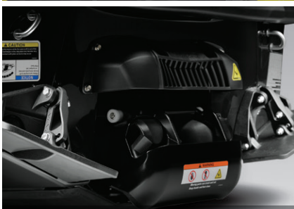
ADJUSTABLE TRIM TABS