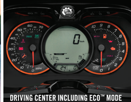
DRIVING CENTER INCLUDING ECO ™ MODE

Type..... 1503 HO Rotax ® 4-TEC ® engine Intake system..... Supercharged with external intercooler Displacement..... 1,494 cc Cooling..... Closed-Loop Cooling System (CLCS) Reverse system ..... iBR ® with electronic brake, neutral and reverse Starter..... Electric Fuel type ..... 87 octane – minimum 91 octane – recommended