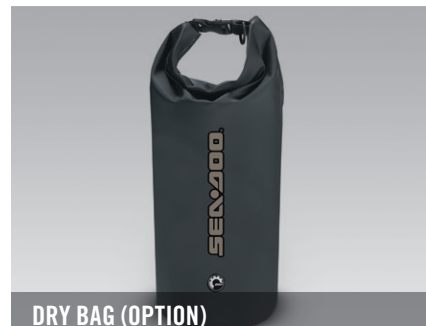
DRY BAG (OPTION)