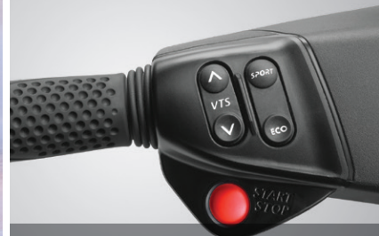
HIGH-PERFORMANCE ELECTRIC VTS ™ (VARIABLE TRIM SYSTEM)