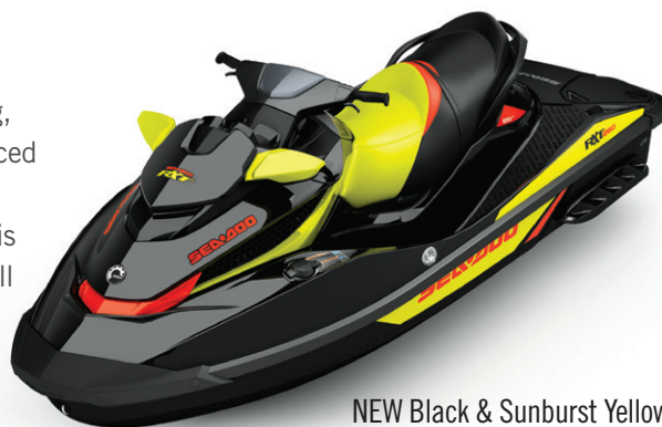
NEW Black & Sunburst Yellow ●

Calibrated for pure performance riding, it includes the essentials of higher-priced models. You get control, precision and handling, plus great horsepower for this price level. And with the S 3 Hull ® , you'll stay glued to the water.