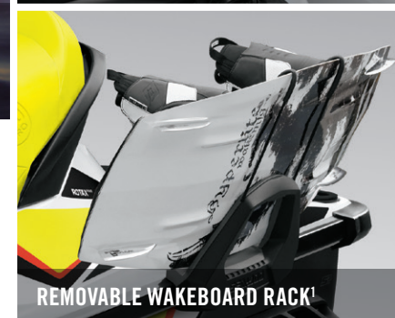
REMOVABLE WAKEBOARD RACK 1