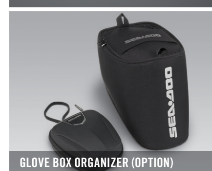
GLOVE BOX ORGANIZER (OPTION)

Get more from your tow sports experience with the supercharged engine of the WAKE PRO 215, speed-based Ski mode and our exclusive S 3 Hull ® for added stability when towing wakeskaters and wakeboarders. This watercraft with its trendsetting details and style is for riders seeking an edge – and them jumping off it.