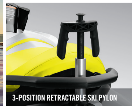
3-POSITION RETRACTABLE SKI PYLON