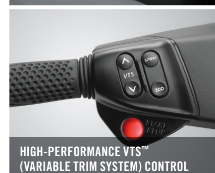
HIGH-PERFORMANCE VTS™ (VARIABLE TRIM SYSTEM) CONTROL