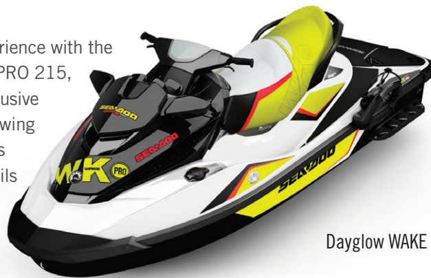
Dayglow WAKE 🌞

Get more from your tow sports experience with the supercharged engine of the WAKE PRO 215, speed-based Ski mode and our exclusive S 3 Hull ® for added stability when towing wakeskaters and wakeboarders. This watercraft with its trendsetting details and style is for riders seeking an edge – and them jumping off it.