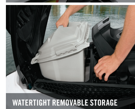
WATERTIGHT REMOVABLE STORAGE