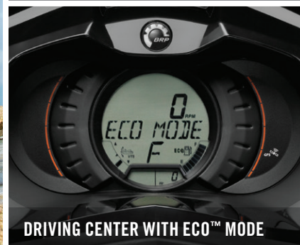
DRIVING CENTER WITH ECO™ MODE