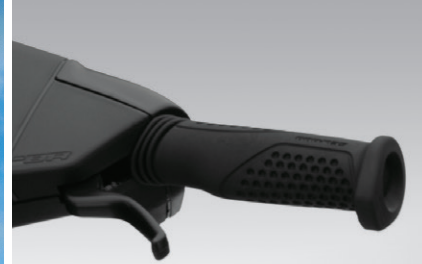
iBR (INTELLIGENT BRAKE & REVERSE)