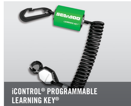
iCONTROL® PROGRAMMABLE LEARNING KEY®