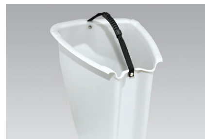
FRONT STORAGE TRAY (OPTION)