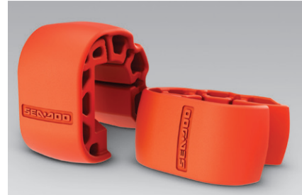
SNAP-IN FENDERS (OPTION)