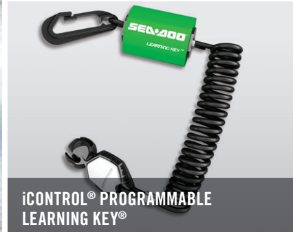
iCONTROL® PROGRAMMABLE LEARNING KEY®