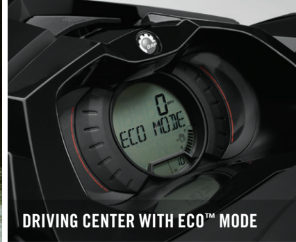
DRIVING CENTER WITH ECO™ MODE