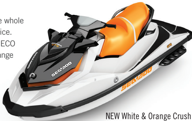
NEW White & Orange Crush

A versatile and fun watercraft for the whole family with an equally fun sticker price. This watercraft is fuel-efficient with ECO Mode and is available with a wide range of features to include a tow hook for watersports and iControl Programmable Learning Key. It also has a durable thermoformed seat for unparalleled reliability.