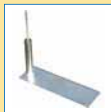
Art. No. 7358