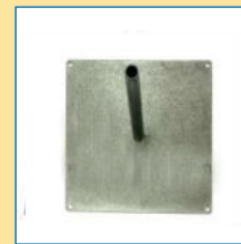
Art. No. 7142