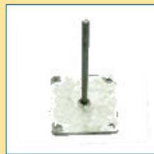
Art. No. 7971