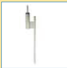
Art. No. 7584

From base pin to umbrella stand, which can be filled with water, it can be used to install the Aventos construction as a representative eye-catcher. It is important that the stand can continuously rotate 360 degrees at all times. The fastening options detailed below are the most frequent sold options. Alternatives can be discussed with our Sales Department. The Aventos is delivered including a steel base pin as a standard, and packed in a luxurious polyester carrying bag. Other options can be discussed.