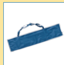
Art. No. 7586

Art.No. 7584 Ground spike. Length 60 cm. Suited for hard soil and sand beach as well.