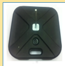
Art. No. 8006