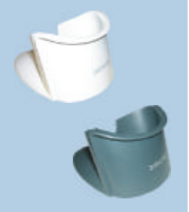
Gryphon™ Desk/Wall holders